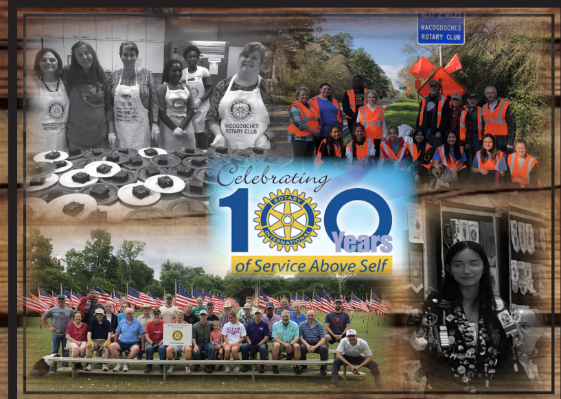
ROTARY CLUB OF NACOGDOCHES 2020-2021

Today our Nacogdoches Rotary Club is 179 members strong. Our club meets at noon every Wednesday at the Fredonia Hotel and Convention Center located at 200 North Fredonia Street. Our club is a large and diverse fellowship of inspired business, professional and civic leaders with significant community connections that foster the ideals of Service Above Self and the high ethical standards of The Four Way Test. Thank You Rotary for making a difference in communities around the globe!